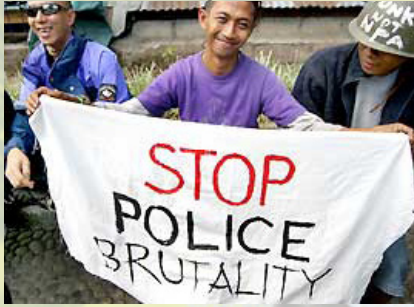
Two of the Sagada 11 Freed!

TWO among the eleven tortured and illegally arrested backpackers also known as the SAGADA11, were already released from La Trinidad District Jail on May 30, Asian Commission on Human Rights (AHR) said, Thursday night.