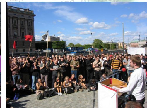
June 3rd, 2006: Pirates gather in Stockholm to protest the May 31st police raid on over a hundred servers related to The Pirate Bay, Piratbyrån, and more. Demonstrators demanded that the Swedish government should seek a compromise on the file sharing issue rather than criminalizing more than a million Swedish citizens.